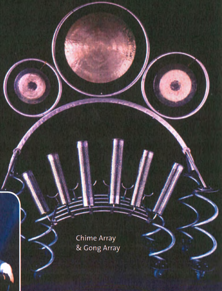
Chime Array & Gong Array