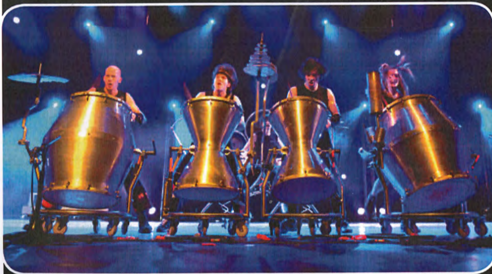
ScrapArtsMusic Artists on Humunga & Hourglass Drums